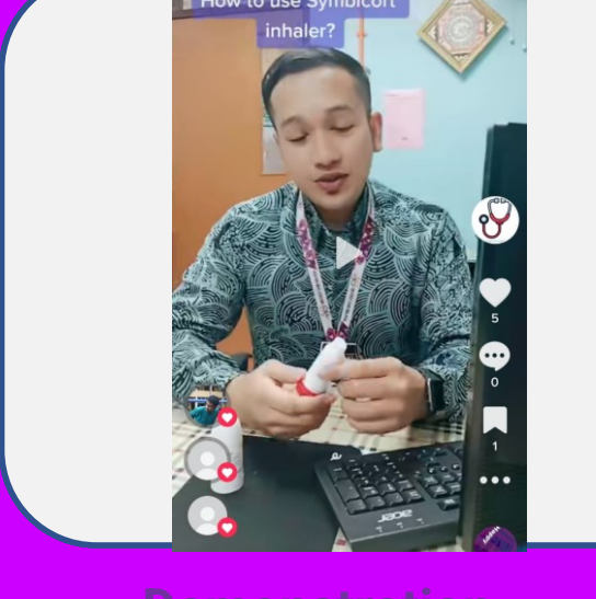
Demonstration of inhaler technique