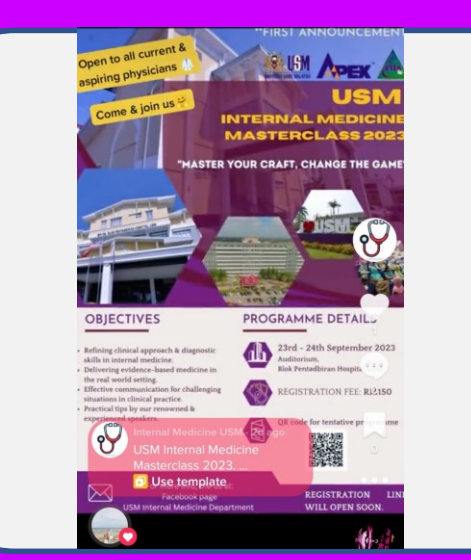
Promotion of nternal Medicine